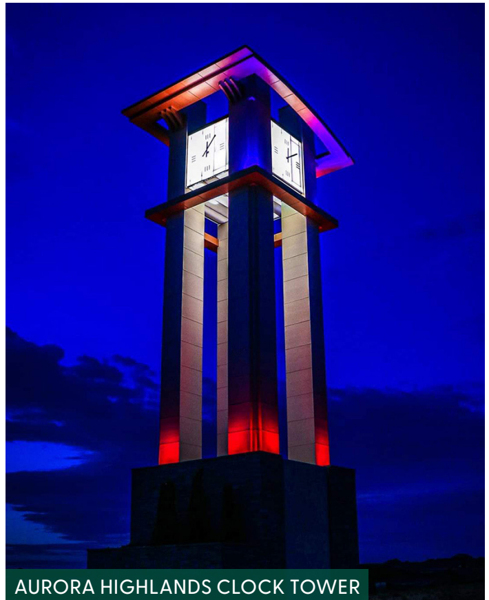
AURORA HIGHLANDS CLOCK TOWER