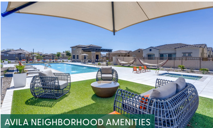
AVILA NEIGHBORHOOD AMENITIES